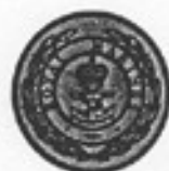
Corps Button All ranks